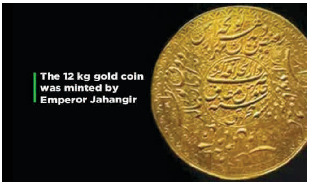
The 12 kg gold coin was minted by Emperor Jahangir

"In 1987, when Indian officials in Europe alerted the central government about the world-famous auctioneer Habsburg Feldman SA auctioning the 11,935.8gm gold coin in Geneva at Hotel Moga on November 9, through Paris-based