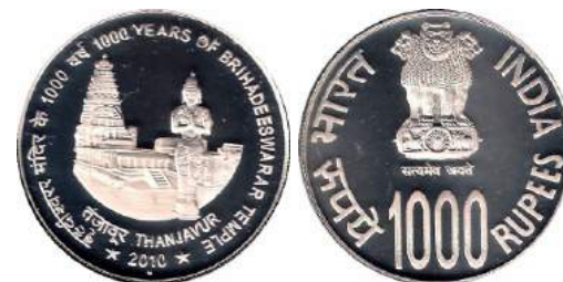
Favorite coin of Rohan Shah

it never sets me satisfied and contented and always the flame of hunger goes on increasing day by day to be the best and unique collector of the coins and currency.