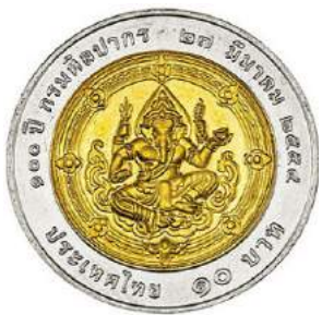
Ganapati Coin of Thailand