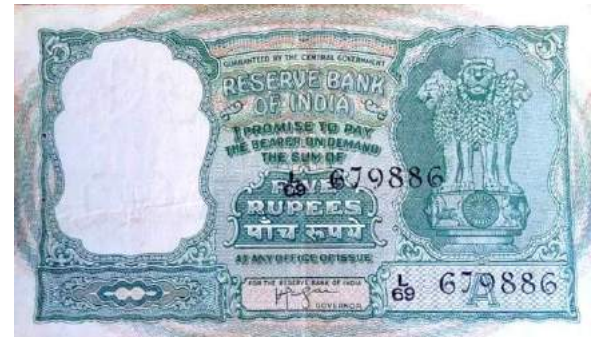
Reported: By Ashish Parui

Recently few currency notes, most of which are the old notes are found tooled with an added serial number to fool collectors. On having a look at the currency note, it may clearly appear that it's a genuine error note with a misplaced or added serial number, thus counting it in a very rare category one may not hesitate to add it as a prized collectible for few thousand rupees. But these error appearing notes are nothing less than 'forged alterations'. The forgers alter the original notes with the help of scanners and color printers and add an extra serial number using the background color combination of the note itself.